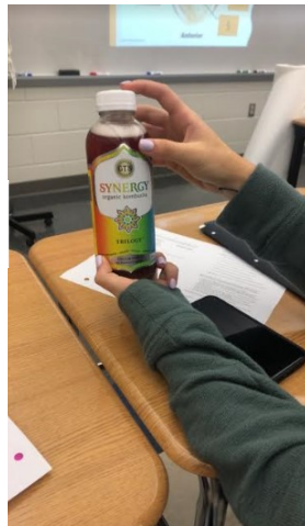
Student drinking a popular flavor during class.