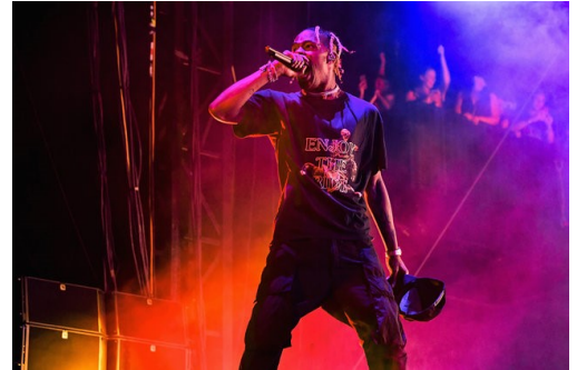
Travis Scott touring for his new album Astroworld

Travis Scott is more than a rapper, he is a worldwide phenomenon. His new album, Astroworld , is double platinum having one billion global streams in the first WEEK. East students couldn't stop listening to it! His documentary "Look Mom I Can Fly" has millions of views on Netflix. Travis Scott is a household name throughout the halls of every high school.